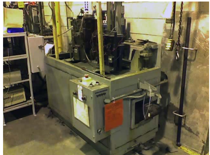
Figure 3. 200 Gallon Tank Filled with Envirotemp FR3 fluid